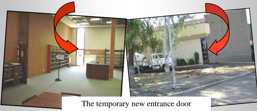
The temporary new entrance door

Construction is starting - we're still here, but a back door will be the front door for some time.