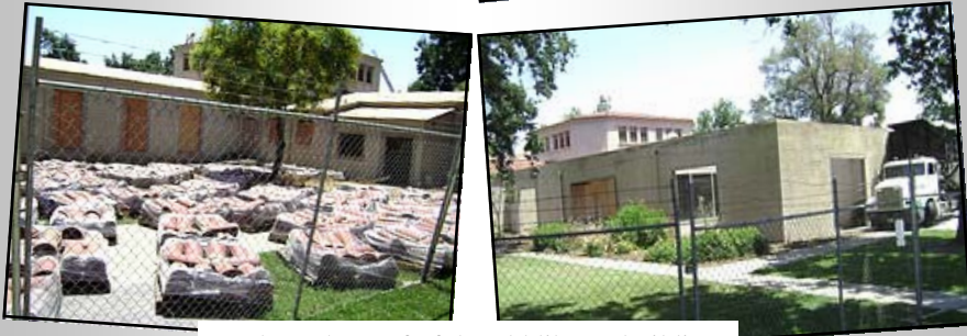
Work on the roof of the old library building